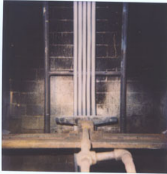
Plate 1: Specimen before test