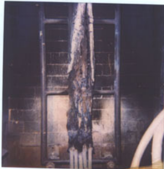
Plate 2: Specimen after test